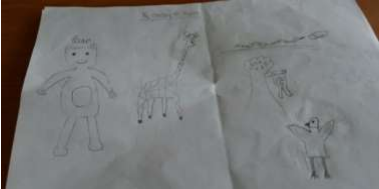
Figure 1. A country in Africa