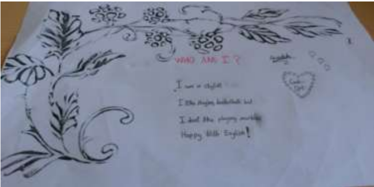
Figure 2. Who am I?